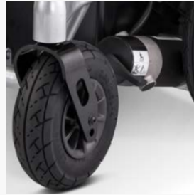
Castor wheels with aluminium rim