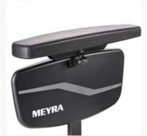
Standard side panel