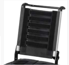
Adjustable seat and back