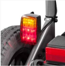
Long-life LED lighting available as an option