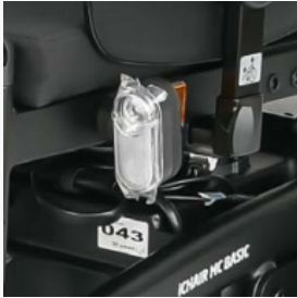
Long-life LED lighting