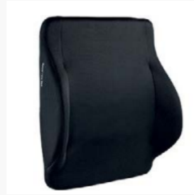
Netti UNO Back (optional)