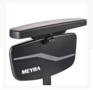
Standard side panel