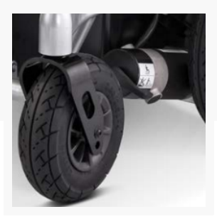
Castor wheels with aluminium rim