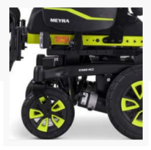
Castor wheels with aluminium rim