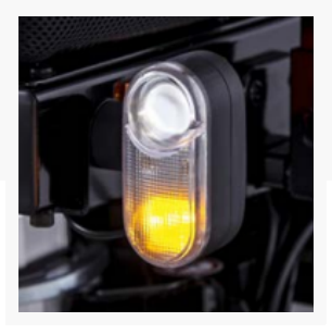
Active LED lighting