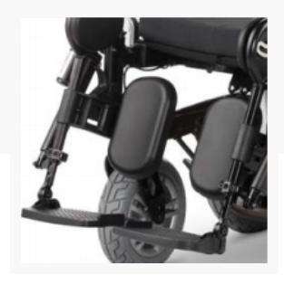
Electrically adjustable legrest available as an option