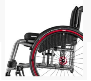
Smooth transition from<br/>br>front frame to seat