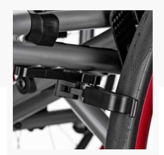
Innovative light brake,<br/>br>swivelling, aluminium