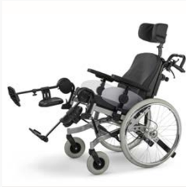
Adaptable in every respect