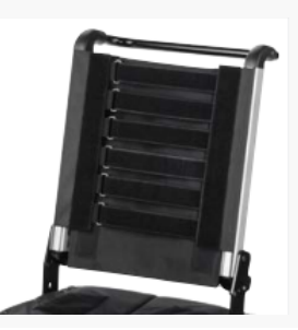
Adjustable seat and back