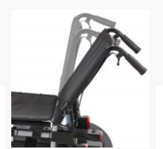
30° back adjustment can be selected as option