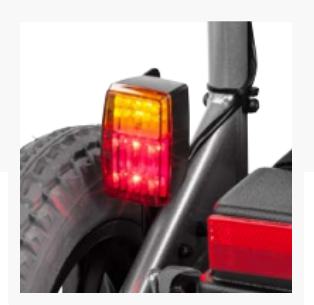
Long-life LED lighting available as an option